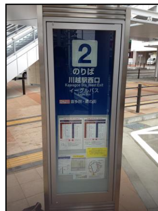
(Right side Photo / CO-EDO Loop Bus stop) (Left side photo / Kawagoe Station bus stop No.2)

Bus stops E1, E2, E9, E10, E14 and E17 are shared by both the Orange-Line and Purple-Line. Please take note of your bus line.